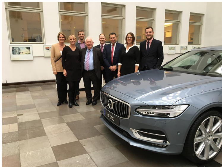
Volvo Plant Visit