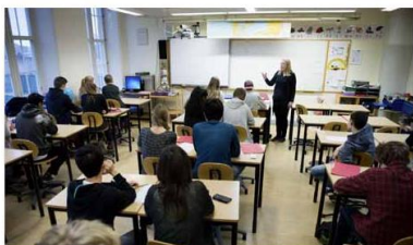
Lärarlönelyftet har skapat osämja bland lärarna på Olofströms skolor. Nu vill Centern kompensera de lärare som blev utan.

– Först var det förstelärarna som fick extrapengar. Sedan var det