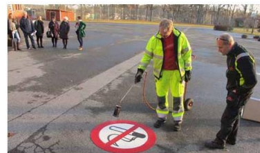
Länsstyrelsen i Blekinge erbjuder alla länets skolor skylttar som påvisar rökförbud i samband med tobaksfria veckan.